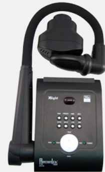
folded for storage